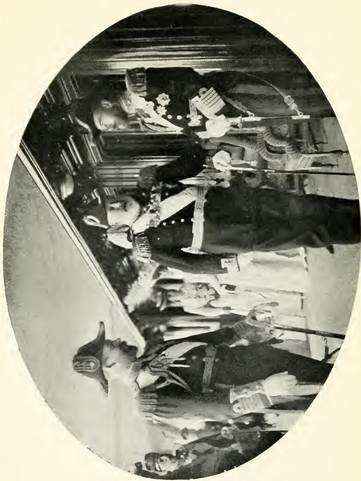
COWES — 1909. The Emperor Nicolas, King Edward, the Prince of Wales, the Empress Alexandra, Queen Alexandra, and the Duke of Connaught on board the "Standart".